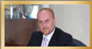
AGIP Participates in INTA Annual Meeting, MEASA Council Formed